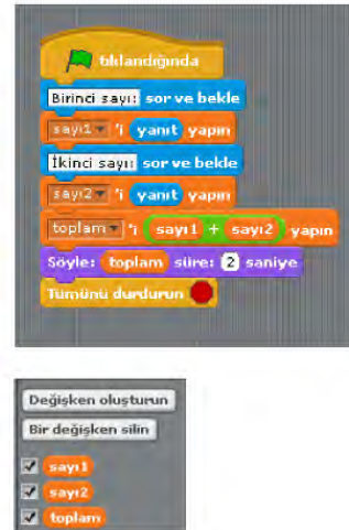
Figure 1. Algorithm of addition, flow diagram drawing and Scratch program codes

In order to improve programming logic of the students by using problem solving method, the algorithm steps of the problem or the command statements in Scratch program were left blank in some sample applications (Figure 2). With similar logic, places of algorithm steps were written in wrong order, and the students were asked to put them in correct order.